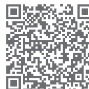
Stand: VII/2023

Our campus university is located in a green area in Berlin-Zehlendorf in the district of Steglitz-Zehlendorf. You can reach the EHB with the S-Bahn S1 to S-Bahnhof Zehlendorf and from there with the buses 285 (direction S+U Rathaus Steglitz) or X 10 (direction Teltow), getting out at the bus stop Schweizerhofpark.